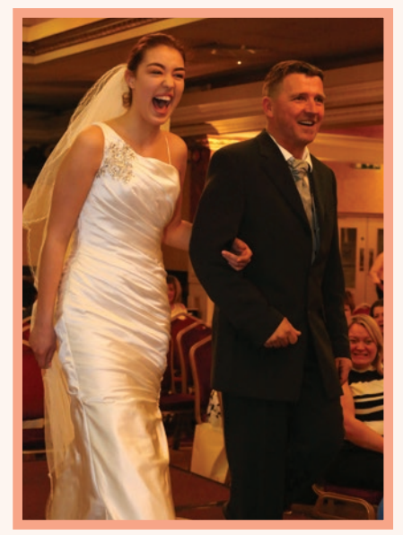
Bride and father of the bride.